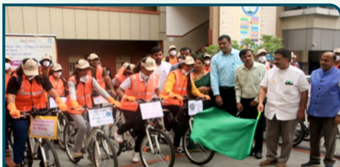
Clean India 3 Days Cycle Jaatha From 8 th October to 10 th October 2021

NSS Unit of Seshadripuram College and Bengaluru City University in Association with State NSS Cell and Department of Youth Empowerment and Sports jointly organised Clean India 3 Days Cycle Jaatha event on account of Azadi Ka Amrit Mahotsav, India@75, the main aim of the event is to collect plastic through cycle rally and creating awareness on plastic usage to the public throughout Bangalore city. From 8th October to 10th October 2021.