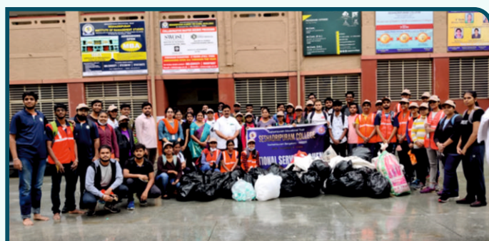
Clean India 3 Days Cycle Jaatha From 8 th October to 10 th October 2021

Day 2 is actually the real test day when all the body pain, cramps etc., show-up but still majority of our volunteers were ready for the challenge because of their previous day's cycling. We started cycling from Seshadripuram College and reached Yeshwanthpuram Railway Station. The programme was inaugurated and flagged off by Shri. Munirathna, Minister of Horticulture, Govt. of Karnataka. On the second day the weather didn't co-operate with us. There was heavy shower but our volunteers didn't give up. With the same keenness we covered in and around Yeshwanthpuram Railway Station, Sankey Tank, Malleshwaram 15th cross, Malleshwaram Flower Market and on the way nearby Seshadripuram. Our volunteers participated with immense enthusiasm