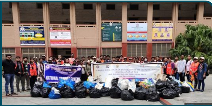
Clean India 3 Days Cycle Jaatha From 8 th October to 10 th October 2021

Day 3 was most challenging day. Because, all the volunteers were completely exhausted. But still our volunteers didn't surrender. We started our ride from Seshadripuram college and covered Palace Grounds, Vasanthnagar, Srirampura, Civil